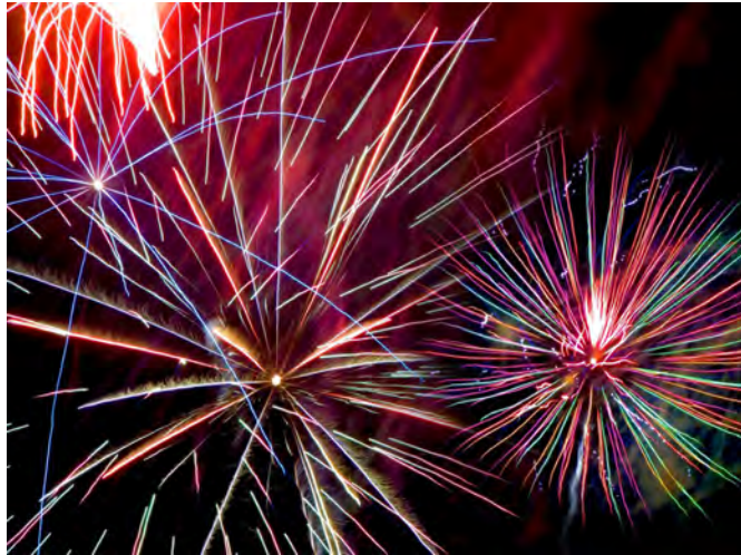
Cooper's Crossing announces plans to host fireworks evening on opening weekend of Airdrie's second annual arts festival.

Cooper's Twilight CARNIVAL Fireworks Music Night Market